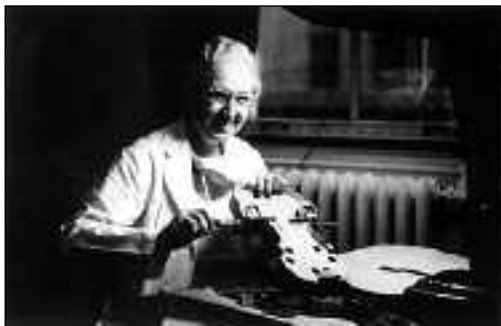
Dr. Virginia Apgar