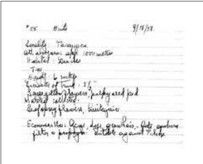
Figure 1. Gill's notes are property of the Guedel Museum and are used here with their permission. Each plant is carefully described along with the location where it grows and indications for how it was used by the native tribes. Ever the optimist, Gill describes this plant (Huito) as able to grow hair.

The field notes written by Richard Gill are the property of the Guedel Museum, and these notes list his botanical collection in detail along with the indigenous