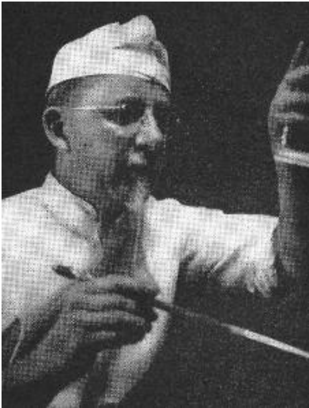
Figure 1: Paluel J. Flagg with his specially designed laryngoscope and straight endotracheal tube (1944).

Titles of anesthesia textbooks were more creative 50 years ago. Consider the original and unique title of Wesley Bourne’s book Mysterious Waters to Guard: Essays on Anesthesia (1958). The title summarizes what we do. Paluel J. Flagg (Figure 1) wrote seven books on anesthesia between the years 1919 and 1944, all entitled The Art of Anaesthesia . Although copyright laws protect the contents of Flagg’s books, his unique title could have been copied by other authors. However, no one has repeated any title that uses the word “art” as a feature of anesthesia.