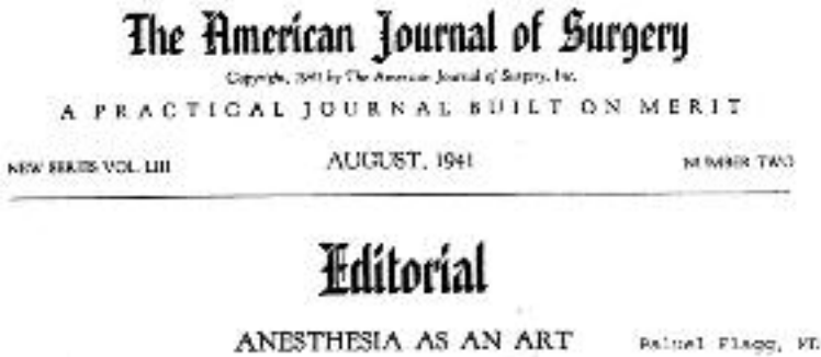
Figure 3: Paluel Flagg kept his concept of art as a component of anesthetic practice alive for over 30 years. This image shows the title of an editorial he wrote on the subject in the American Journal of Surgery in 1941.

From our perspective, Flagg’s anesthetic seems pathetically inartistic: mask ether inductions, intubation of the trachea under deep anesthesia, use of straight endotracheal catheters without cuffs, spontaneous respirations, no use of muscle relaxants, and intramuscular morphine for pain. For the patient, this must have been a horrific experience. Contrast that with today’s anesthetic wherein the practitioner has some ability to manage nausea and vomiting, control postoperative pain, and promote an early recovery.